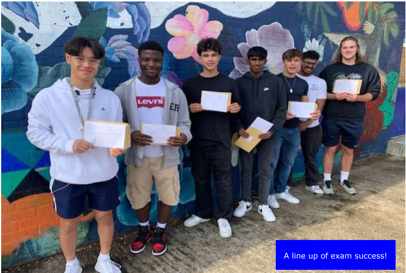
A line up of exam success!